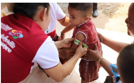
Figure 3: Measuring a child's MUAC (middle upper arm circumference). 16/03/2023, Nayang village, Thoulakhom district, Vientiane Province.