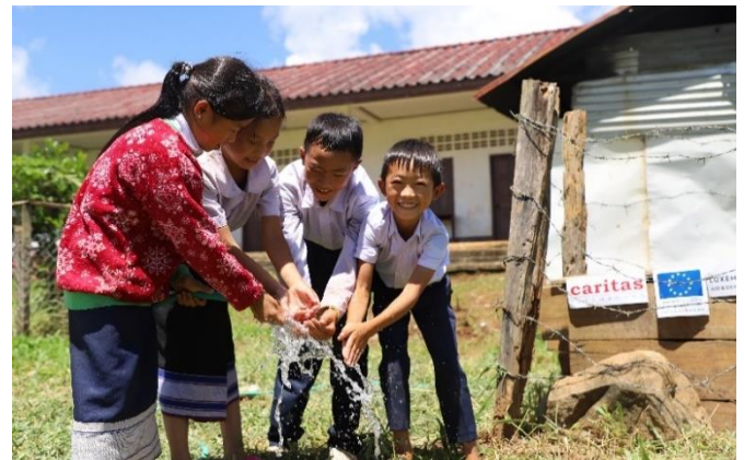
Figure 2: Children testing the new clean water systems. 21/09/2023, Naxay village, Phaxay district, Xiangkhouang province.