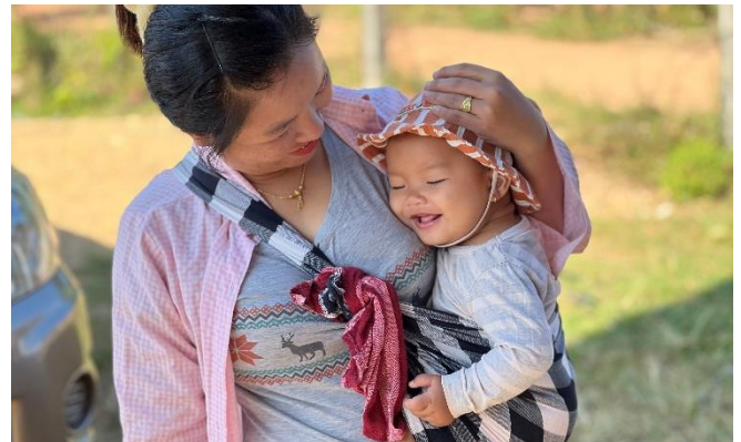
Figure 2: Mother and child. 19/11/2023, Nayang village, Thoulakhom district, Vientiane province.