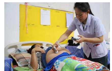
Figure 5: Pregnant woman receiving medical assistance. 17/11/2023, Naphaeng village, Thoulakhom district, Vientiane province.