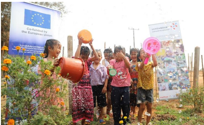
Figure 1: Children enjoying clean water. 28/03/2023, Nayang village, Thoulakhom district, Vientiane province.

In more concrete terms, this tailored approach focused for example on equipping the population in targeted villages with essential hygiene practices, ensuring access to clean water, and establishing proper latrines. Pregnant women and children were identified as key beneficiaries who gained increased access to vital health services.