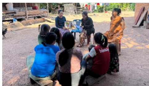
Figure 4: MSG open-space discussion. 20/11/2023, Namyam village, Thoulakhom district, Vientiane province.