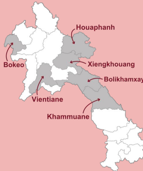
Map 1: Provinces of Laos where Caritas is currently active.

This first newsletter of 2024 focuses on Nutrition and will guide you through the achievements of Caritas' ProCSpNut project and how it made a change the current nutrition situation in Lao PDR.